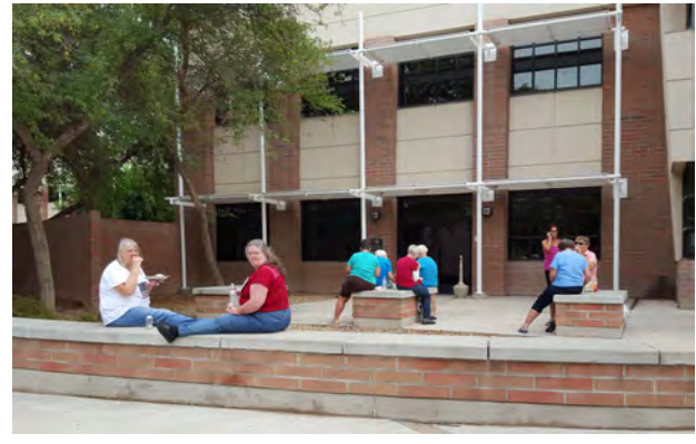
Above: Enjoying lunch outside the police department community room on a sunny day. Left: Wonderful volunteers hard at work.